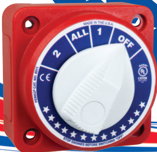
8511DP0USA Selector Switch

Small Size, High Capacity Matches 8500/9600 Series Bolt Circle For use with Alternator or Generator 6 to 32 V.D.C. Systems., Stud Size: 3/8" 315 AMPS Continuous, 450 AMPS Intermittent