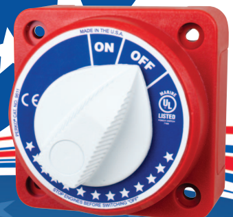
9611DP0USA Disconnect Switch